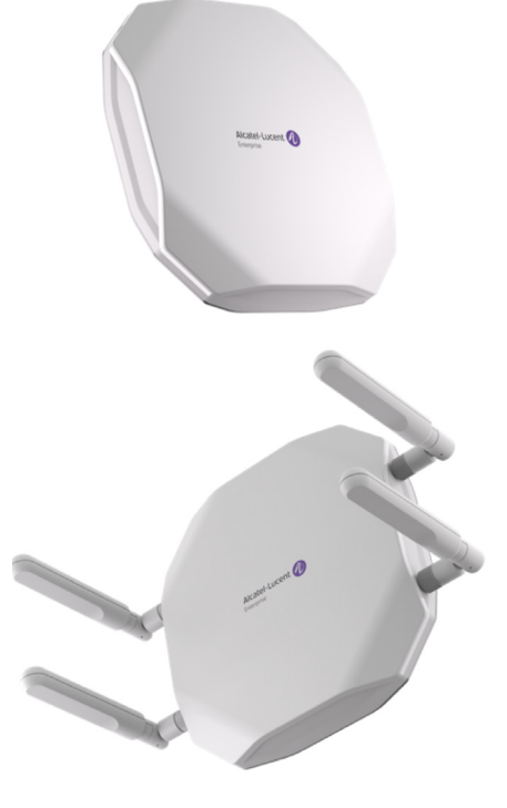
OmniAccess Stellar <u>OAW-AP1320 Series</u> Indoor Wi-Fi 6 access point

Across the networking industry, building wireless LANs that deliver a combination of enterprise grade capability and operational simplicity will become the new standard for business networking.